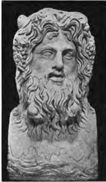
Fig. 41. Head of a Sea-God.

A stranger and more mysterious “Old Man of the Sea” was Pro'teus, the shepherd of Posei-